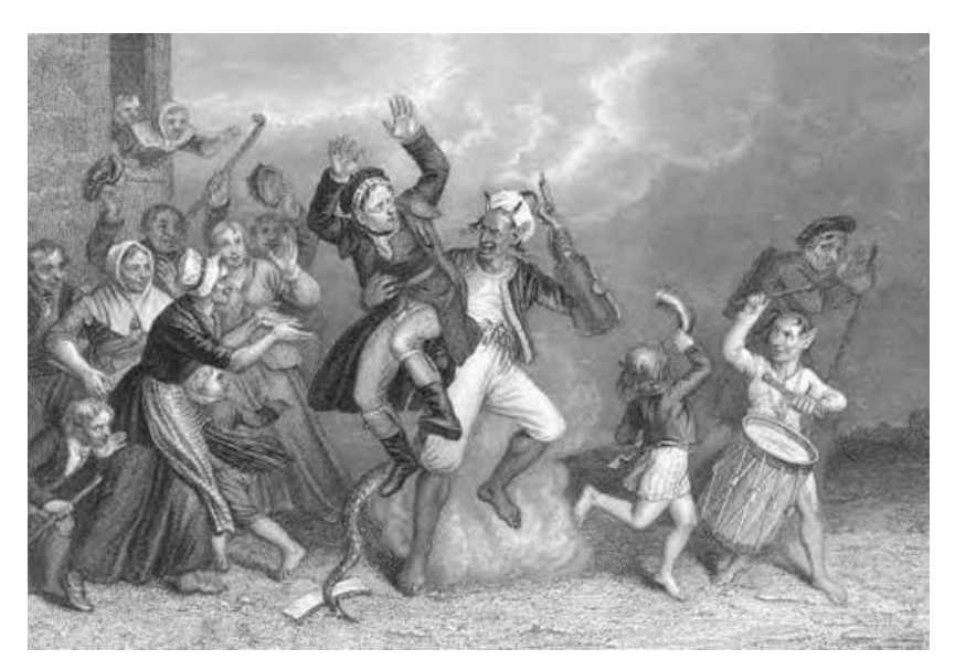
Old comic representation of the Devil with a fiddle

who are not our husbands and wives. A subtle form of fornication is still fornication, and there certainly are degrees of sin. The blatant abuse and extreme of this can be found in the night clubs, which are designed to be nothing less than a complete bombardment of the senses, with drink, drugs, music and dance designed to inflame lust, and draws the unsuspecting victim down the road of hedonism. The whole experience is designed to parade a man or woman to the extremes of vanity, with clothing that turns a human into a clothes horse, a sexual object not a person, no more than an animal, reducing the whole event into a sense dulling meat market, which usually attracts the worse sorts of character and behaviour, not the best. It is obvious to all, that places such as this, are often celebrated as a hot bed of sin. It is sin which is the Christians enemy and wherever he sees that foe he is on his guard. That is why wise Christians are wary of something which the world is blind to, or if they see it, do not see the danger, because the concept of sin is not a serious one in the unconverted mind. So it will carry them away. Anyone who is serious about discovering the deeper things in life should run a mile from these places. Godliness and 'worldliness' are like oil and water.